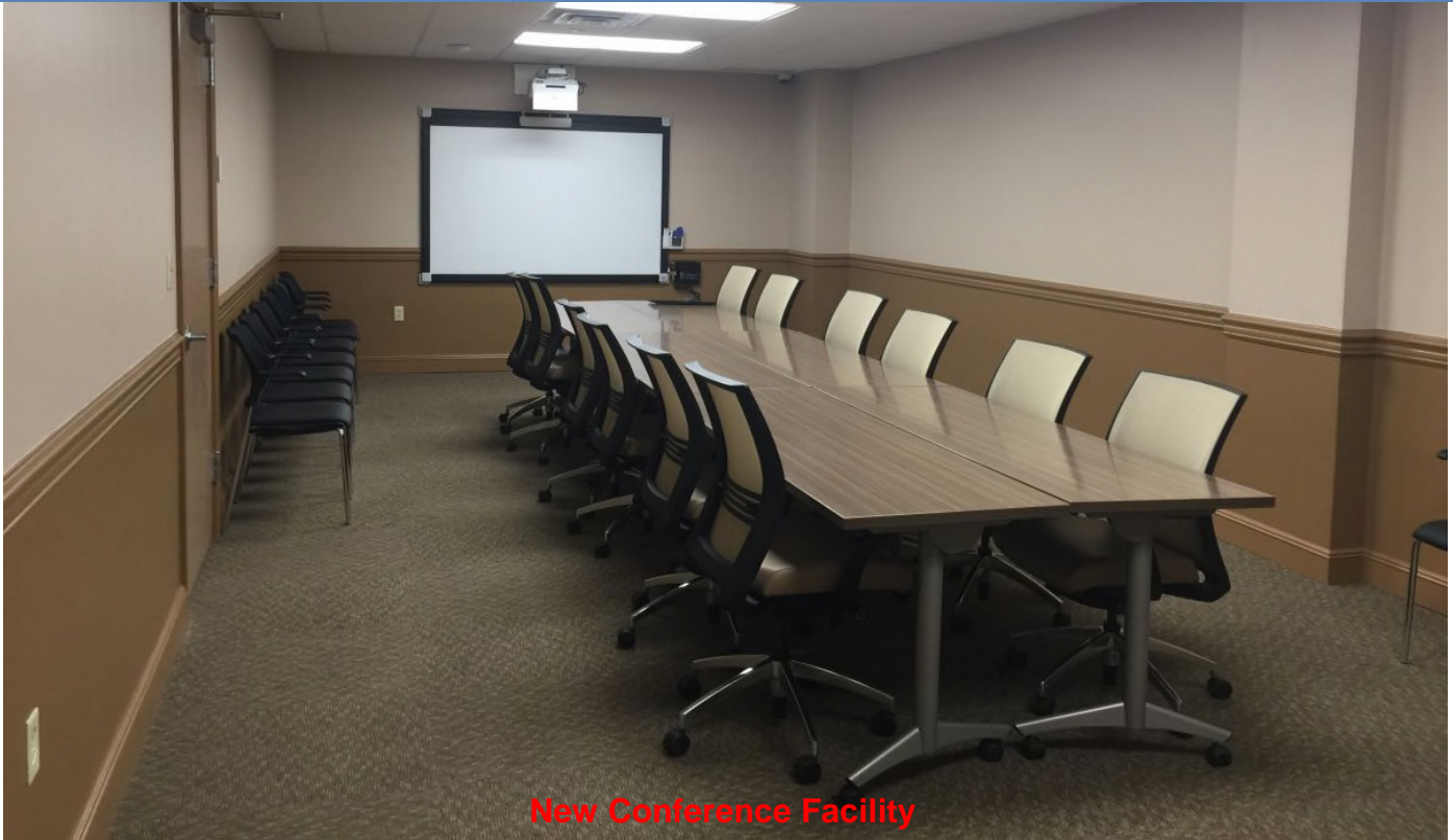
New Conference Facility